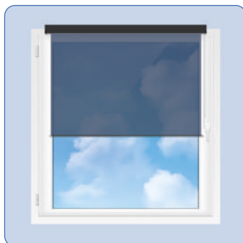
2 Carpentry fastening (fixed window)

The fixing bar of your film blind is placed on the wall directly above the window frame. The fixing bar may protrude slightly from the frame, the blind will have to be pulled up to allow the window to be opened.